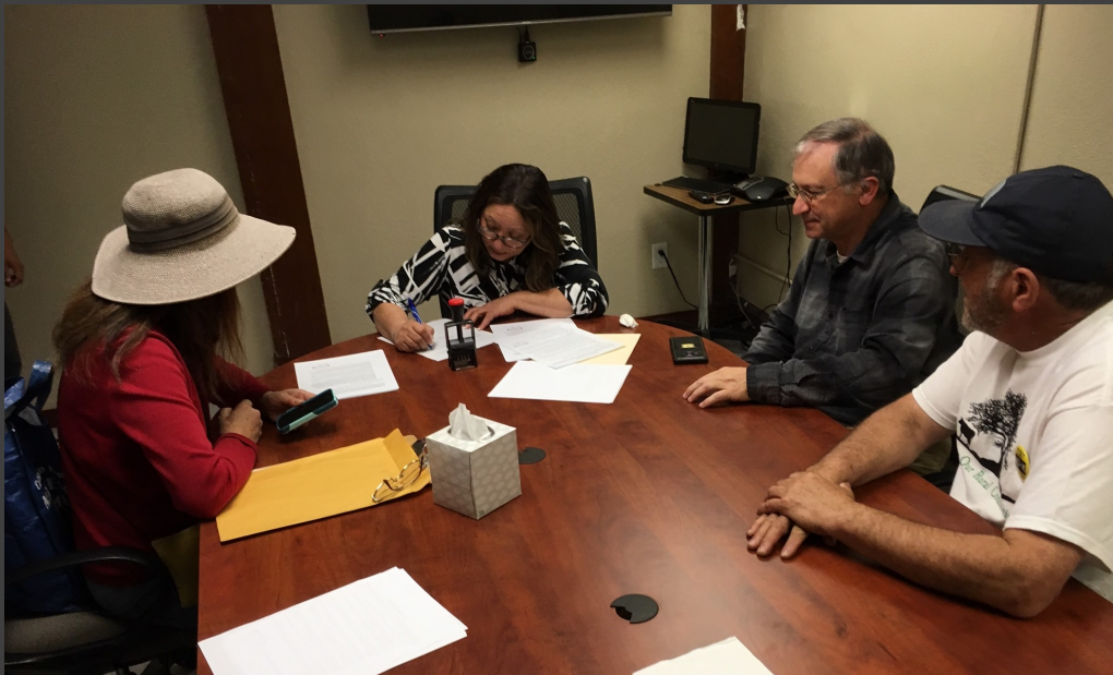
Submitting Hollister Initiative to City Clerk