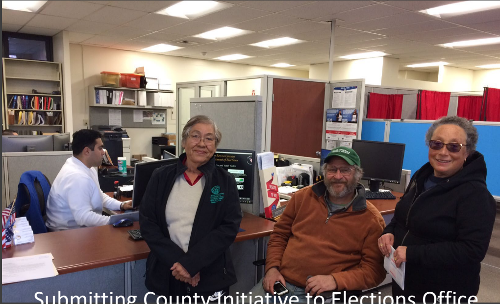
Submitting County Initiative to Elections Office